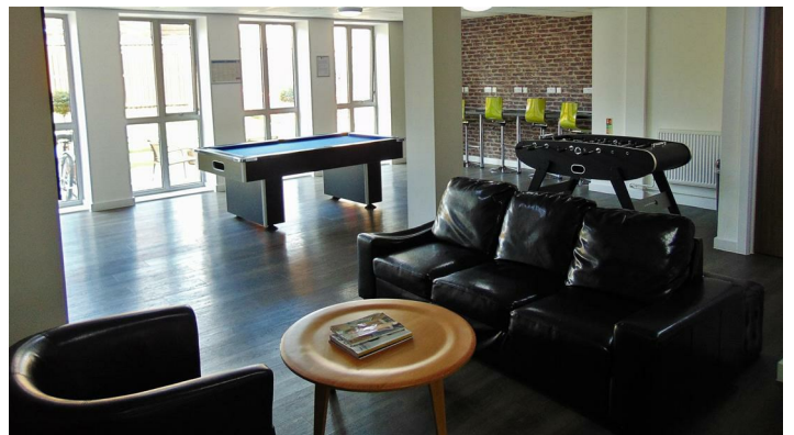
Communal games room with pool, table football and seating areas