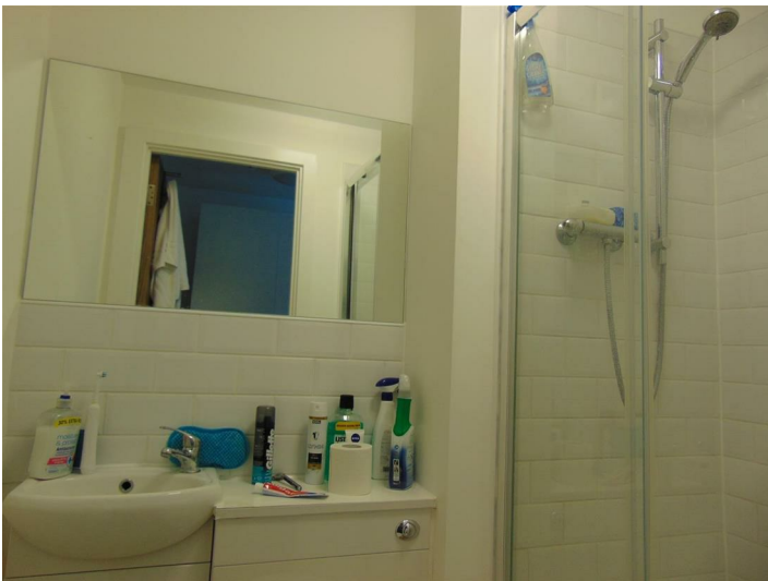
Walk in shower, vanity unit with mixer tap and wall mirror