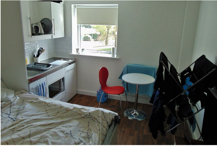
Wood effect flooring, kitchenette area, bedroom area and double glazing windows.