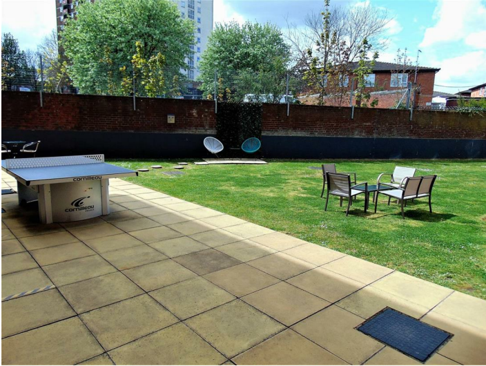
Patio with table tennis and a grassed area with seating