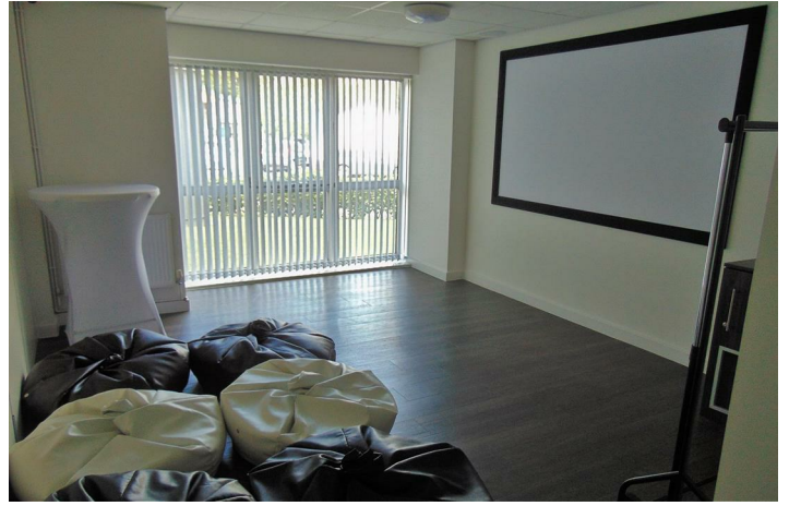
Wood effect flooring, beanbag and screen