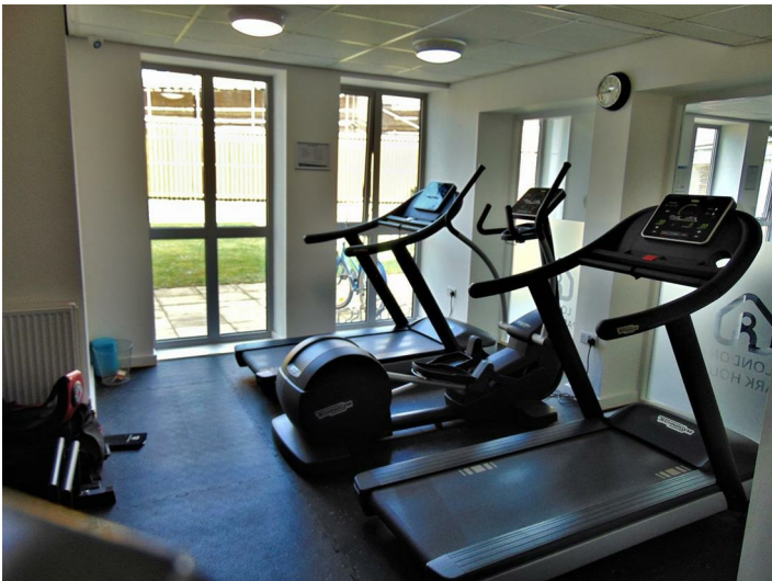
Rubber matted floor and various gym equipment