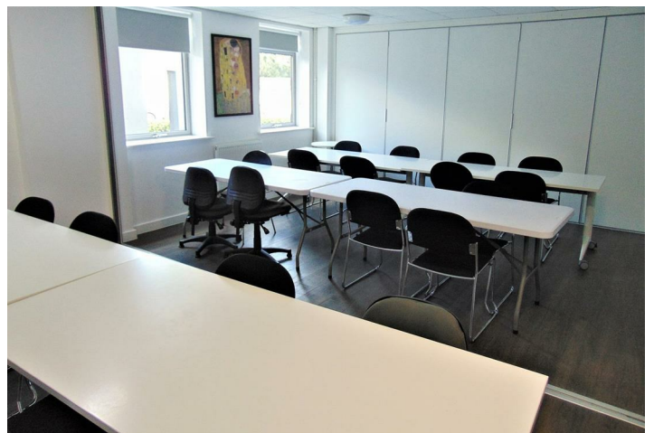
Meeting table and chairs with the ability to divide the room into two